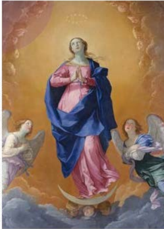
The Immaculate Conception, 1627, artist: Guido Reni (Italian). Met. Museum. Collection.